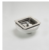
AC17SQ Basket Waste