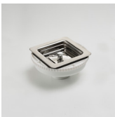
AC17SQ Basket Waste